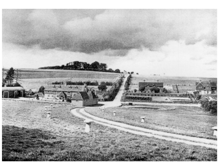
Freemantle Park farm, photographed in 1936

the Downs belonging to the estate, and gave access, on the northern boundary, to a road leading into Kingsclere. The total area of the farm was 454.352 acres, including 13 acres of woodland, 165 acres of downland (including the 100 acre Freemantle Park Down), 88 acres rough pasture, about 9 acres arable, and the remainder grassland. There were numerous well-built hunting jumps on the property (three removable oak rails). The farmhouse itself dated from about 1792, though part was older. It consisted of a lounge, hall, and two other reception rooms, eight bedrooms